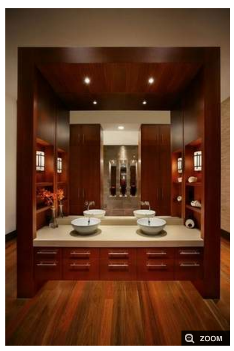
Community guest bath