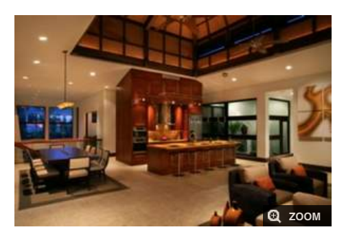
Community gathering room at Sea Glass on Sanibel / Renderings special to news-press.com